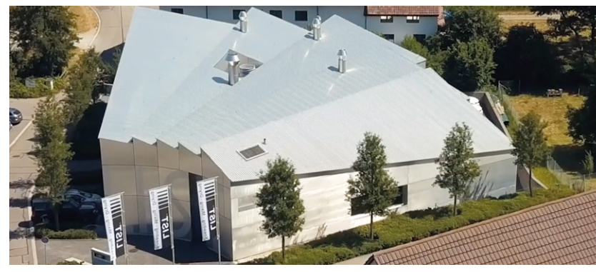
LIST Technology Customer Center in Arisdorf, near Basel Switzerland.

Next to the specifics of the KneaderReactor itself, a very important aspect in the development of the process is the handling and feeding of materials into the Reactor, as well as the appropriate and safe handling of products and waste.