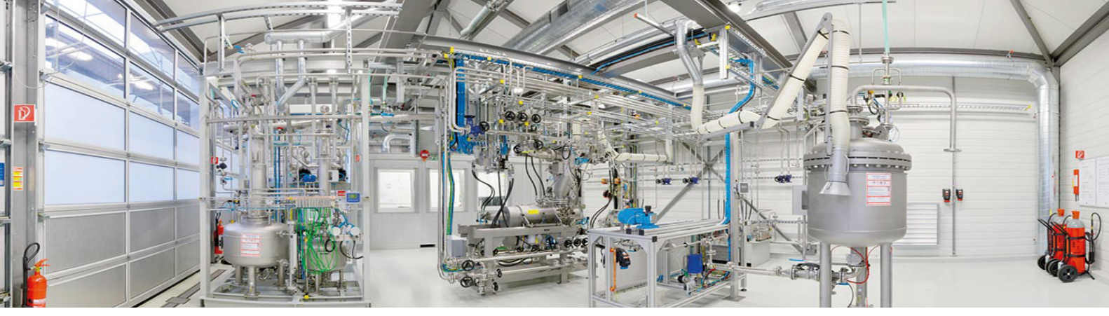
LIST Technology Test Center, Arisdorf, Switzerland